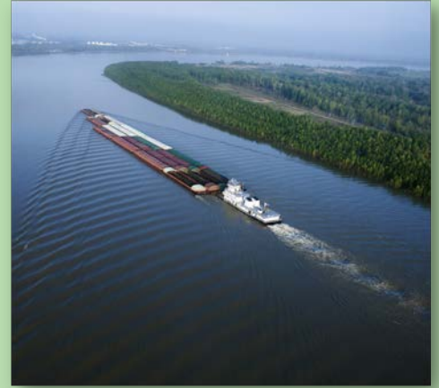
*Sources: Mississippi River Cities & Towns Initiative, NOAA, Union of Concerned Scientists, Northeast-Midwest Institute

Communities of color, Indigenous, rural and low-income communities along the river disproportionately bear these costs. Existing federal programs lack sufficient coordination and partnerships to address these challenges and shared responsibility.